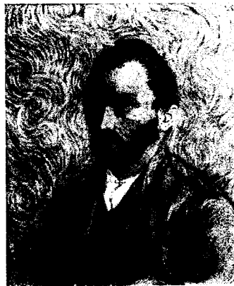
Vincent van Gogh "Self-Portrait" 1889. Oil on Canvas. 65x54cm.

"The way that each artist has applied the paint onto the canvas is very different. Van Gogh shows his depression by using swirling brushstrokes and Gericault has used smooth brushstrokes relying on dark colour and the expression on the mans face".